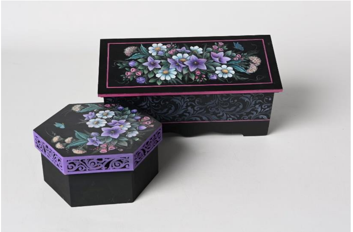
Bell Flowers & Daisey's Price TBD