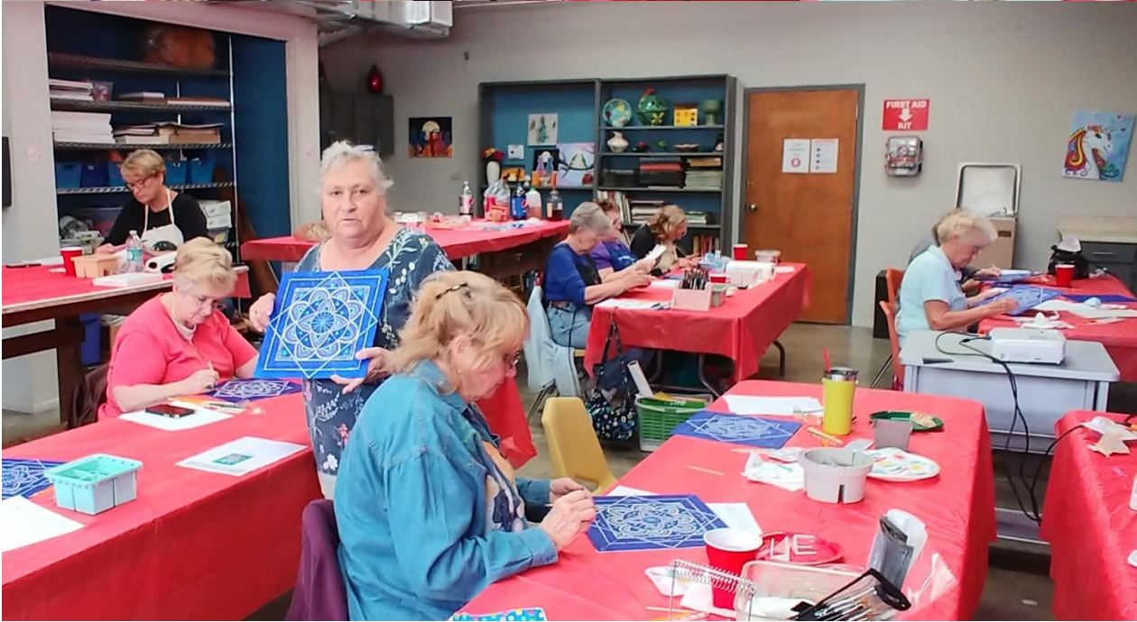
Show N Tell