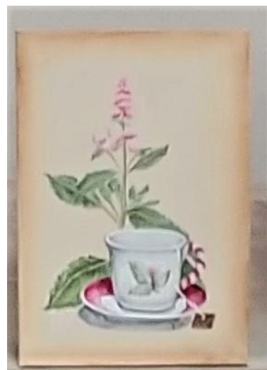
Pam House- Hope box