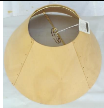
#9 - Wooden Lamp Shade 15-1/4"R x 8-1/4"H, top circle 5- 3/4"