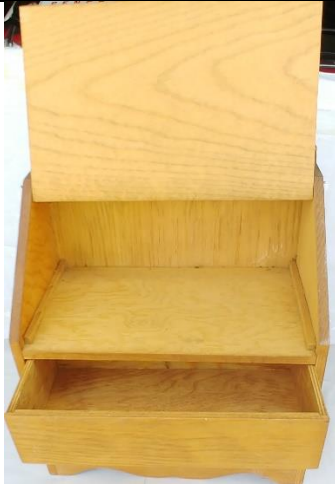
#13 - Wooden two-drawers jewelry chest 11-1/2"H x 11"W