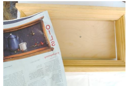
#6 - Wooden Clock w/instructions No clock works Inside 14-3/3" x 6-3/4" H