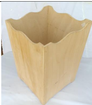
#10 - Wooden Scalloped waste basket 11-3/4"H x 7-3/4"W - on 4 sides