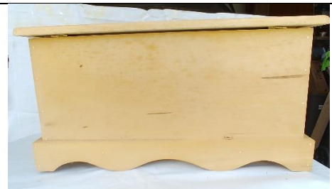
#12 - Wooden Chest 16-1/2"L x 7"D x 9"W