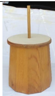
#11 - Small Wooden butter churn 7-1/2"R x 7-1/2"H Not counting handle