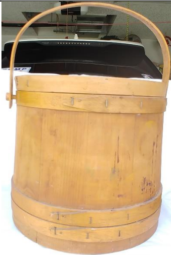
#14 - Wooden sugar bucket 11"H x 12"R