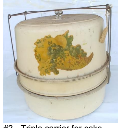
#3 - Triple carrier for cake, cookies, or pie. 10"H x 10"R