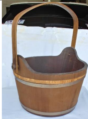
#5 - Wooden Bucket 7"H x 12"R