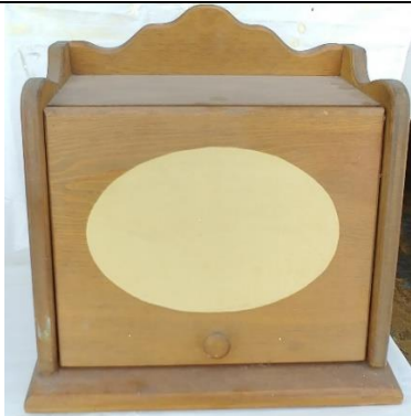
#7 - Wooden stained bread box 14"W x 12"H