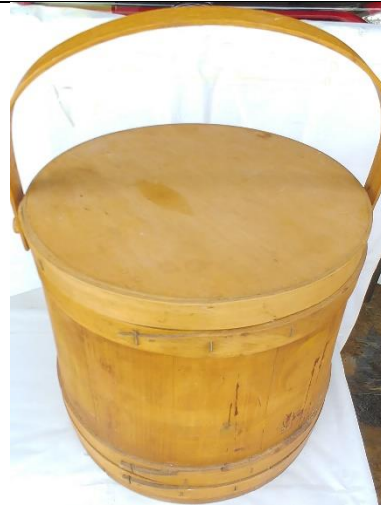
#14 - Top view

The silent auction will close on the evening of Thursday, September 17, 2020. The winner will be notified on Friday, September 18 th . If you are coming to the workshop on September 19 th , you can get your items then. If not, and there isn't anyone to pickup the items for you, you will be responsible for any shipping cost.