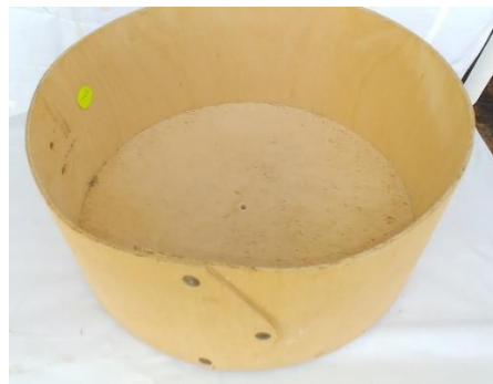
# 8 - Wooden cake cover needs knob 5"H x 11-3/4"R