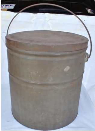
#1 - Covered metal bucket 10-1/2" H x 10" R