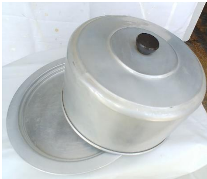
#4 - Aluminum Cake Container 5-1/2" H x 11" R