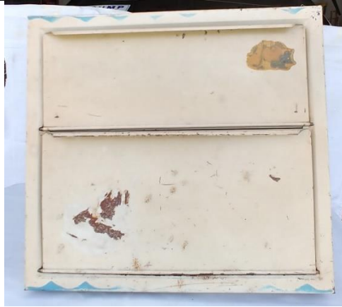
#2 - Metal double door bread box 12-3/4" W x 12"H