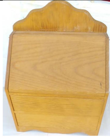
#13 - Top view