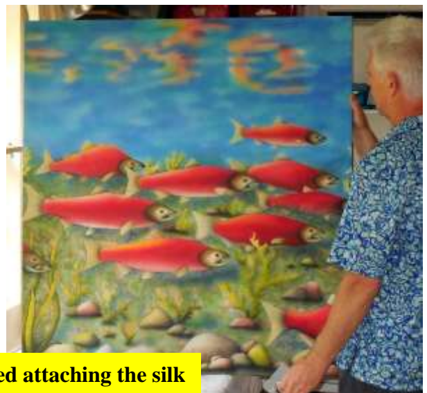
Just finished attaching the silk

I just finished a large silk painting of red salmon, (took a couple years of now and then painting) and my husband built a canvas and stretched the silk in less than a day!